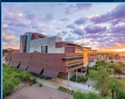
PHOENIX CAMPUS Phoenix Bioscience Core