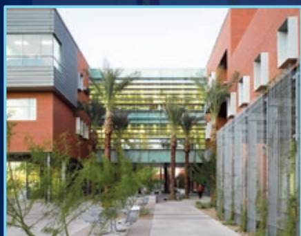
TUCSON CAMPUS Drachman Hall

The UArizona Mel and Enid Zuckerman College of Public Health is the first nationally accredited college of public health in the state of Arizona, with campuses in Tucson and Phoenix.