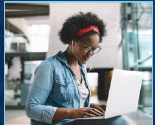
ONLINE & GLOBAL Worldwide Learning