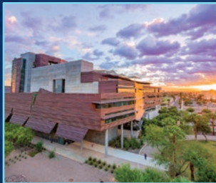
PHOENIX CAMPUS Phoenix Bioscience Core