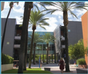
TUCSON CAMPUS Drachman Hall

The Arizona Mel and Enid Zuckerman College of Public Health is the first nationally accredited college of public health in the state of Arizona, with campuses in Tucson and Phoenix.