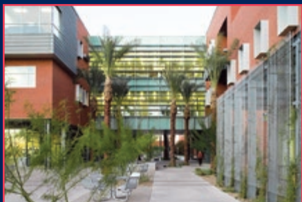
TUCSON - MAIN CAMPUS Drachman Hall

The UArizona Mel and Enid Zuckerman College of Public Health is the only nationally accredited college of public health in the state of Arizona, with campuses in Tucson and Phoenix.