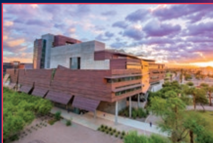
PHOENIX CAMPUS Phoenix Bioscience Core