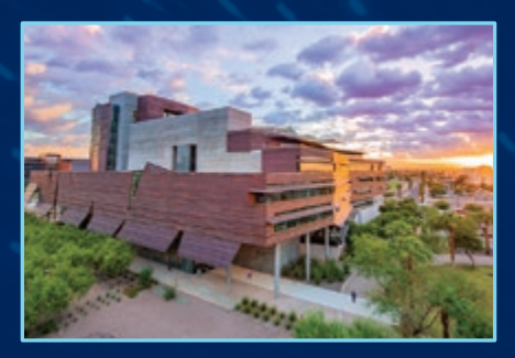
PHOENIX CAMPUS Phoenix Bioscience Core