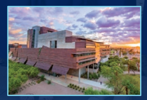
PHOENIX CAMPUS Phoenix Bioscience Core