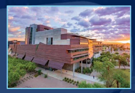
PHOENIX CAMPUS Phoenix Bioscience Core